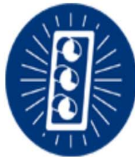
Backplates with Retroreflective Borders