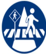
Medians and Pedestrian Crossing Islands in Urban and Suburban Areas