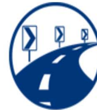
Enhanced Delineation and Friction for Horizontal Curves