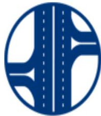
Corridor Access Management